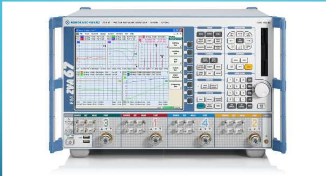
A Rohde & Schwarz 4 port 8GHz Vector Network Analyser

Price New approximately $150,000 AUD and up!